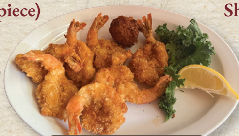
Golden Fried Shrimp

Five large shrimp stuffed with our special seafood dressing and basted with garlic butter | 17.99