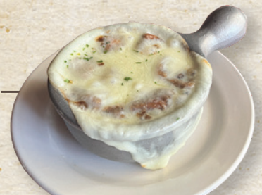
Baked French Onion Soup

New England Style Clam Chowder 6 oz. Cup 5.99 | 10 oz. Bowl 6.99