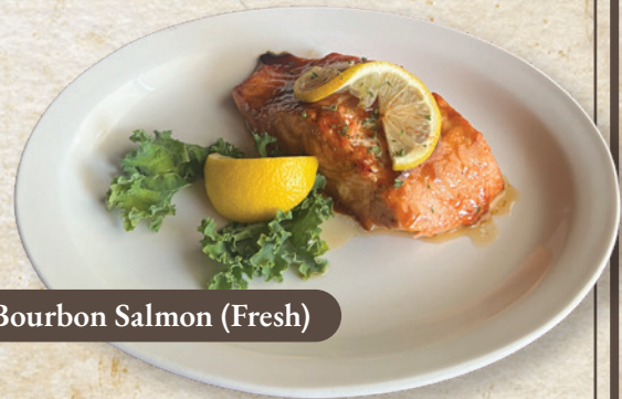
Bourbon Salmon (Fresh)

North Atlantic 10oz. cod filet broiled to perfection | 17.99