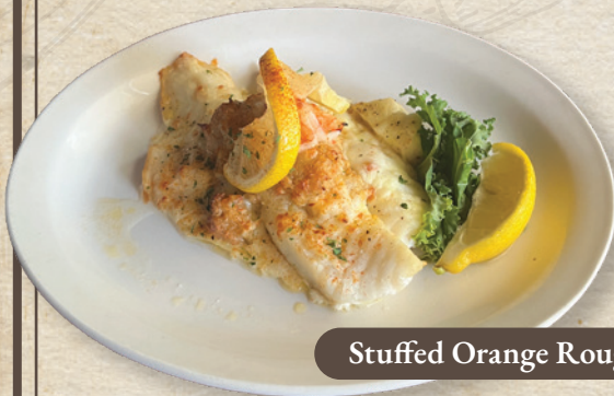
Stuffed Orange Roughy

Mild white fish broiled in lemon butter. Try it blackened | 21.99