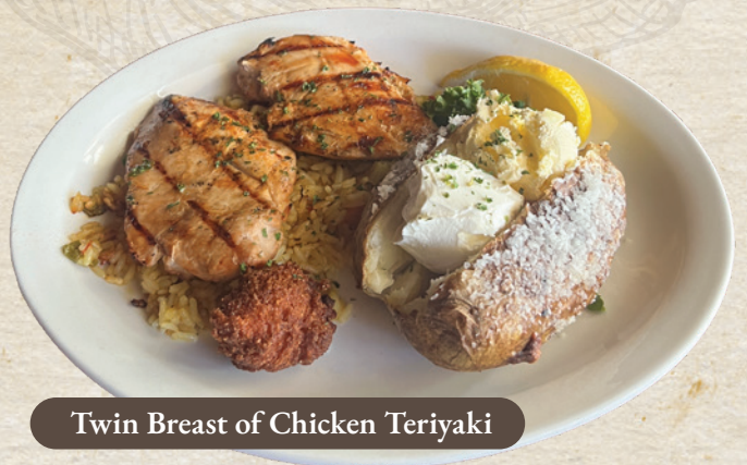
Twin Breast of Chicken Teriyaki

Five pieces of breast tenders, deep fried to a golden crisp | 14.99