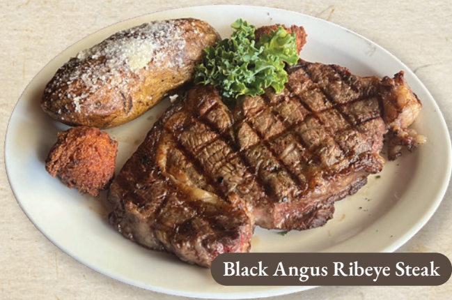
Black Angus Ribeye Steak

21-day aged 16oz. ribeye charbroiled over open flames | Market Price